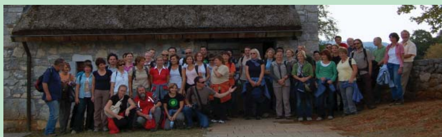
Study visit of Regional park Škocjanske caves