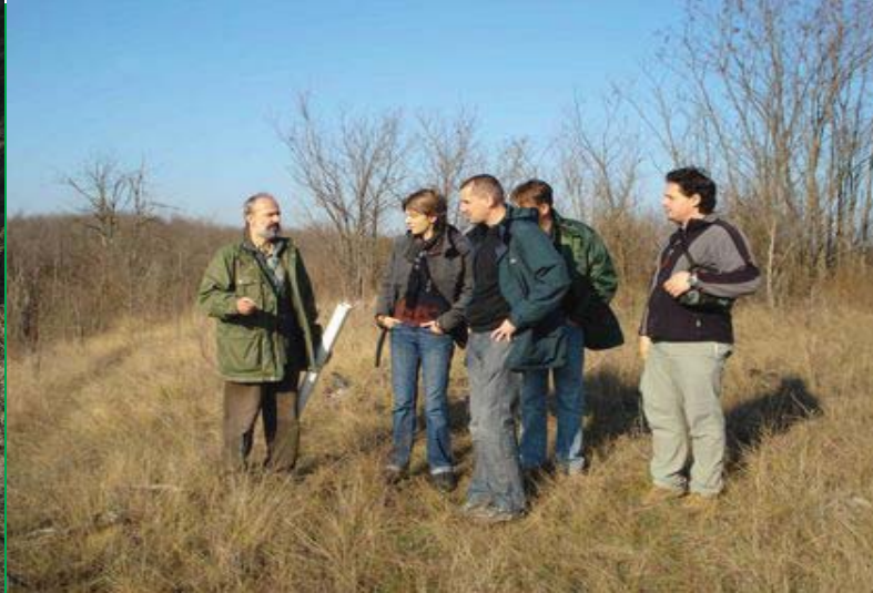
Field trip Deliblato Sands