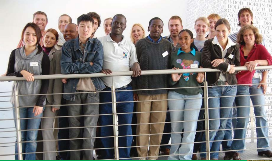
Participants MPA course 2007