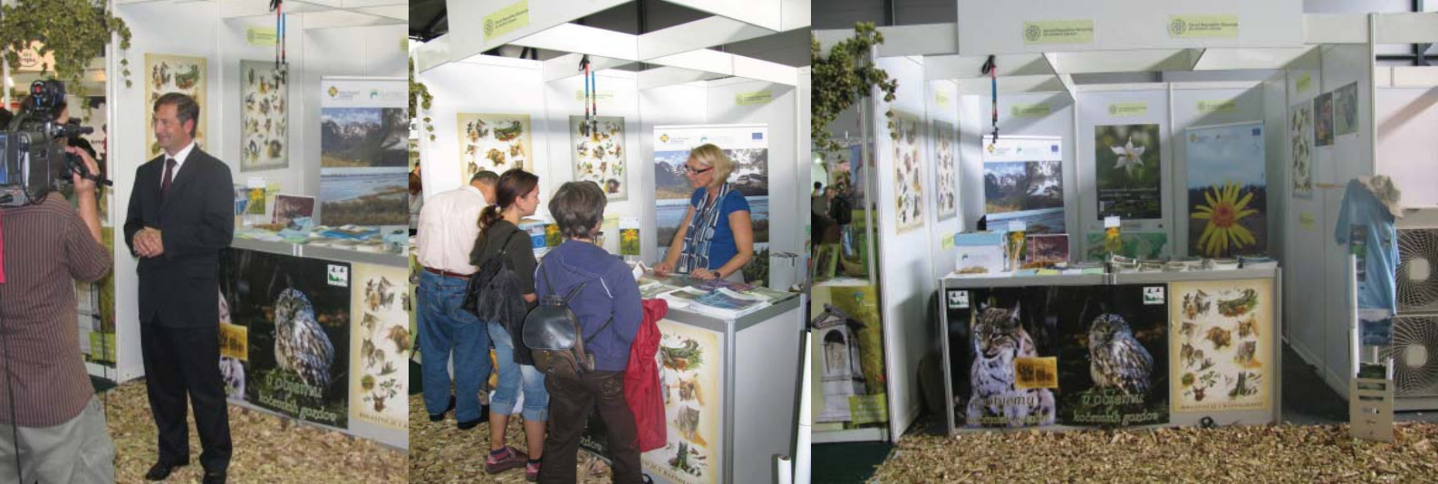
Minister Karl Erjavec giving the interview