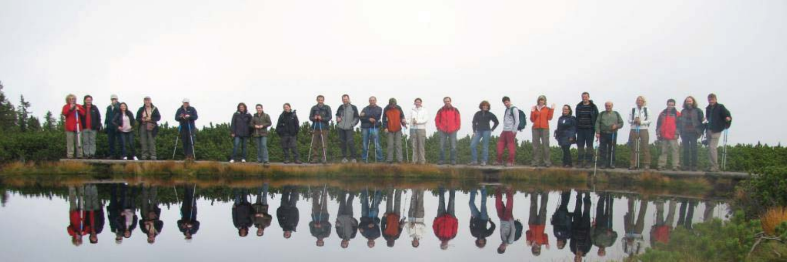
Field trip - Lovrenška jezera