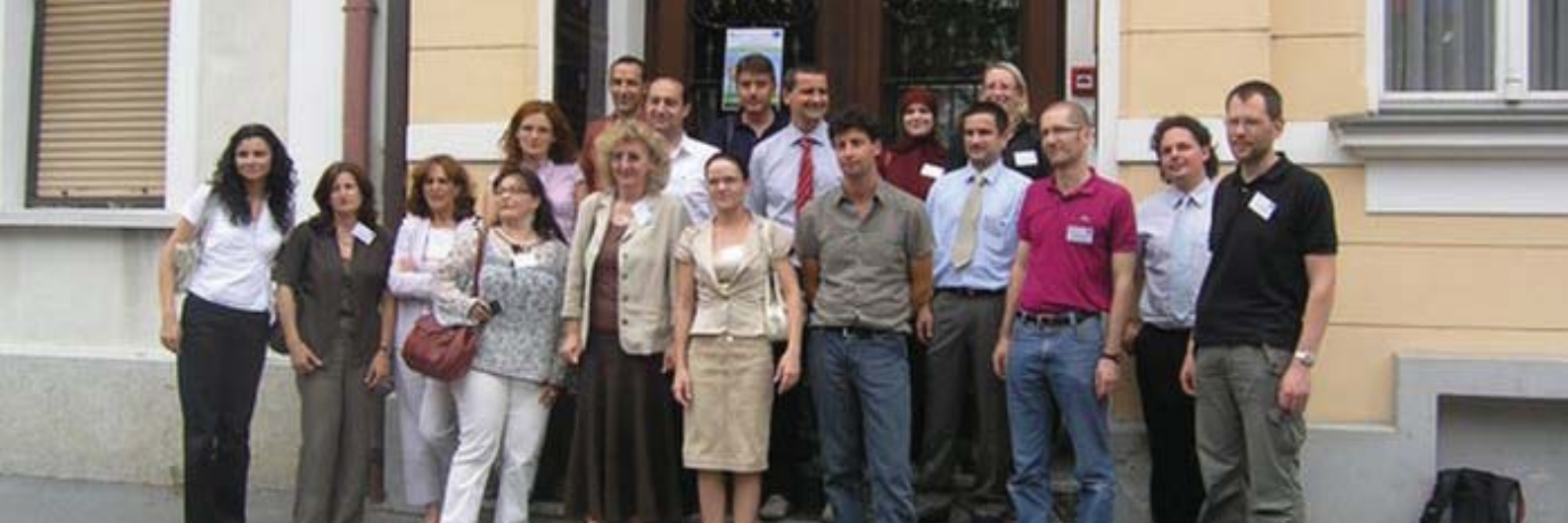
Participants on Kick-off Meeting in Koprivnica