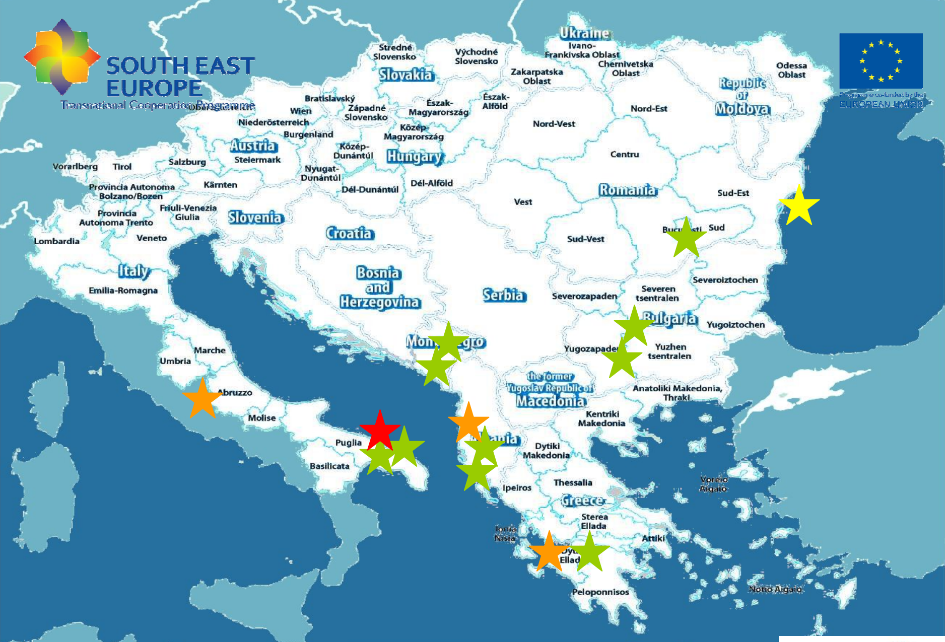
South East Europe (SEE) Programme area (NUTS 2)