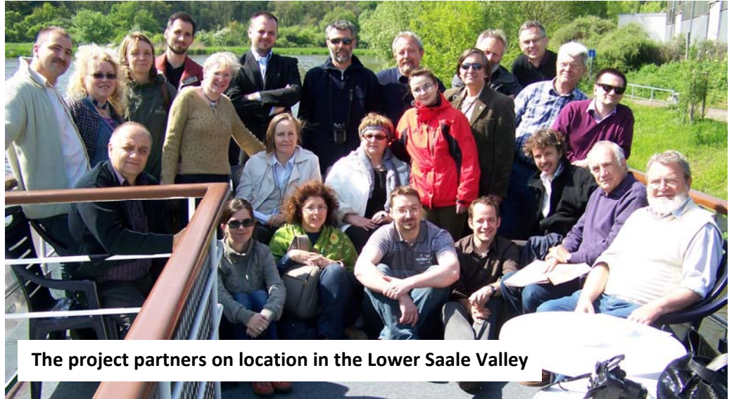
The project partners on location in the Lower Saale Valley