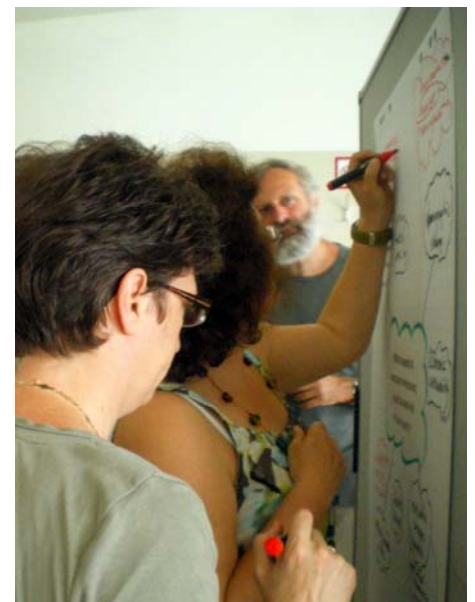
Brainstorming on how to evaluate already implemented projects

Work Package 3 comprises the development and/or adaptation of innovative methods for visualising and moderating changes to the landscape (for example GIS databases, 3D animations, participative moderation as per Agenda 21). On the 1 July 2010, the work group, consisting of representatives from all eight partner institutes, met to examine existing approaches and discuss their future implementation. A core aspect was the establishment of common definitions for key terms and the elaboration of criteria for evaluating the success or failure of already implemented projects and processes in landscape and regional development. A résumé and protocol is available online from www.vital-landscapes.eu .