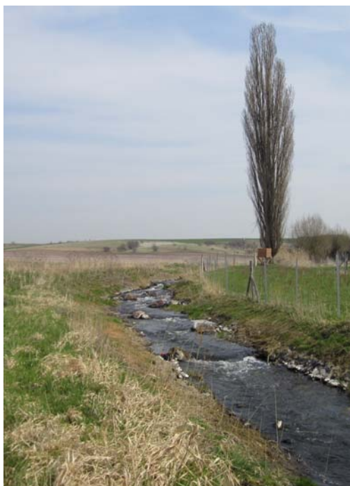
Realized Ecopool project: The Aller river near Wefensleben, Saxony-Anhalt, before and after re-routing to its natural riverbed (2008/2010)