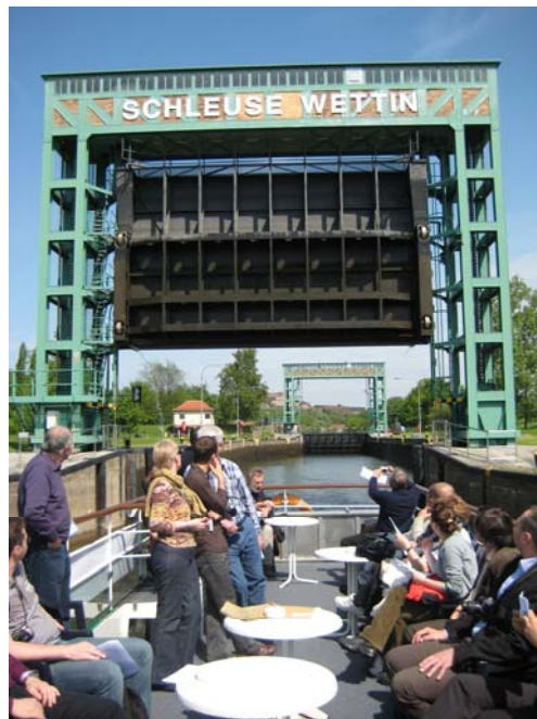
Project partners exploring the Lower Saale Valley pilot region by boat

The kick-off conference on 20-21 May 2010 in Magdeburg, Germany, marked the official start of the VITAL LANDSCAPES project. The partner institutes presented their joint aims and planned measures to 70 or so guests from Germany and abroad. The programme and presentations can be downloaded from the project website: www.vital-landscapes.eu .