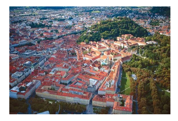
The City of Graz

See you in Graz at 4<sup>th</sup> Transnational Partnership Meeting VITO.