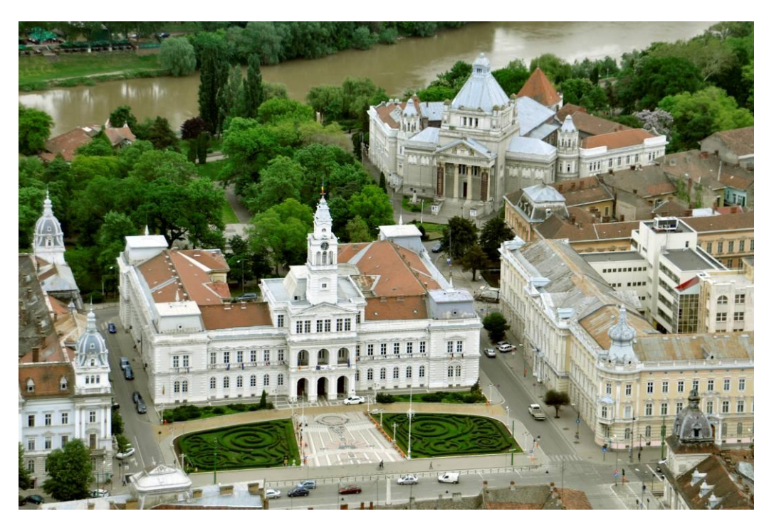
City of Arad

The facade survey for 35 buildings in the historical centre of Arad was finished. All gathered information: documents, designs, photographs of the facades, historical documentation and architectural details are all vitally necessary for the future rehabilitation.