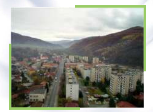
Hnúš a, Slovakia